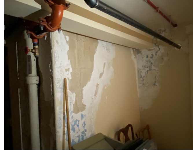
Auditorium – Roosevelt Hall